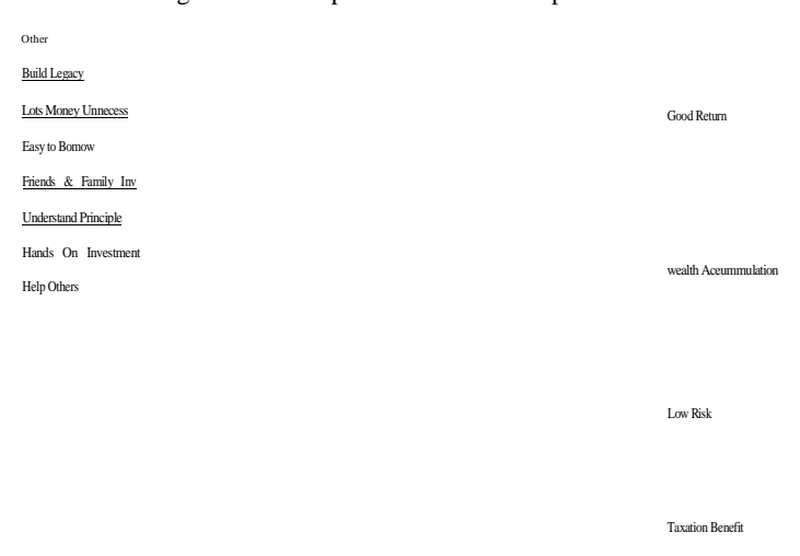
Figure 3 Most important investment in portfolio

the 2nd, 12% the 3rd, 14% each the 4th and 5th important reason.